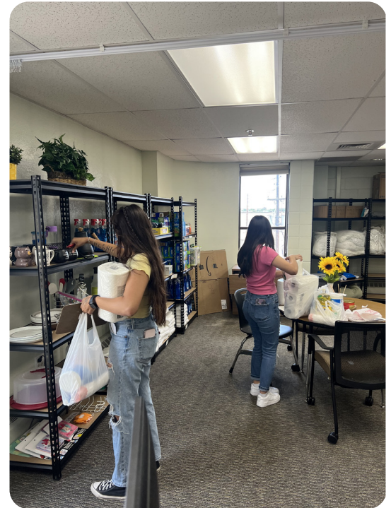
Students shopping at the Housing Basic Needs Store.