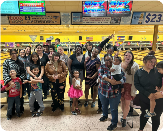
FloCrit alumnae and their families enjoy a free night of bowling with a few FloCrit staff at Crown Lanes Bowling.