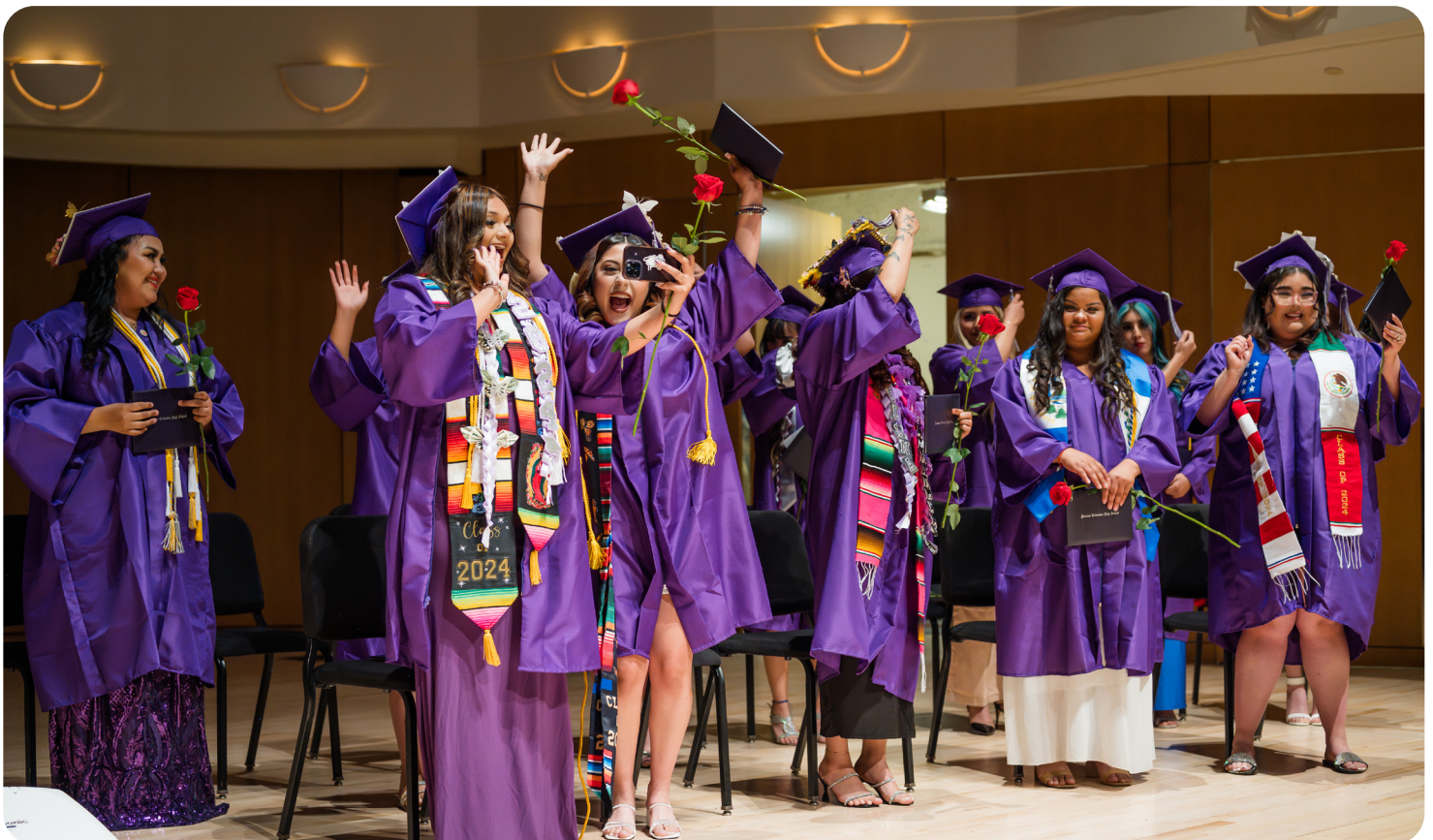
FloCrit Class of 2024 graduates celebrate their accomplishment