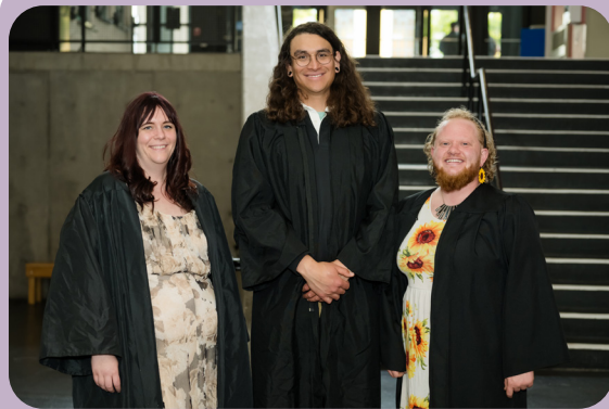
FloCrit High School teachers pose for a photo.