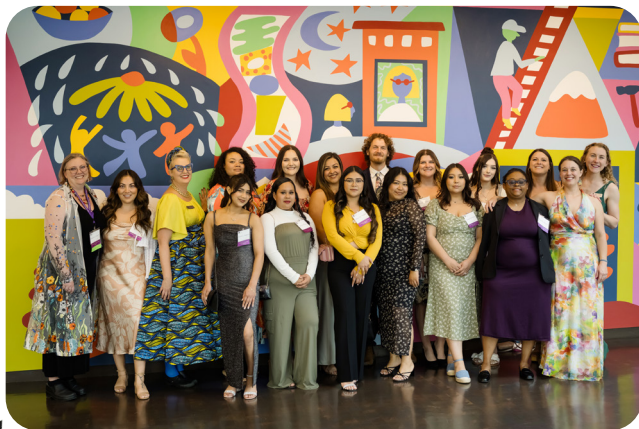
FloCrit staff and students pose together.

Thanks to the generosity of our community, Pathways to Empowerment: Manifesting Abundance raised $233,000 to support our mission of educating, preparing, and empowering teen moms and their children.