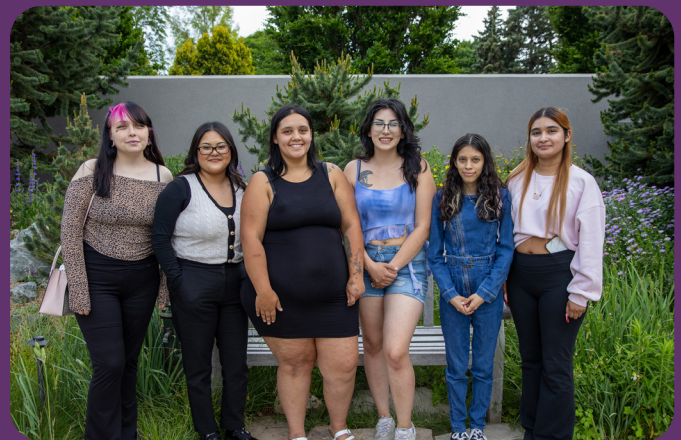
6 members of the FloCrit Class of 2020 pose for a photo.

FloCrit's Student & Alumni Engagement Committee hosted an alumni event in June at the Denver Botanic Gardens, bringing together graduates from a wide range of class years. The gardens offered a chance to slow down, connect, and reflect. One highlight of the event was the reunion of