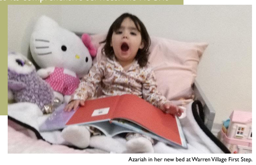
88+ FAMILIES RECEIVED HOUSING SUPPORT LAST YEAR

Housing Program provides two years of dedicated case management and continually expands to meet community needs. Alongside financial aid and relocation support, FloCrit equips teen families with essential skills for long-term success beyond FloCrit.