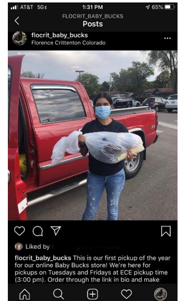
Our first pick up!