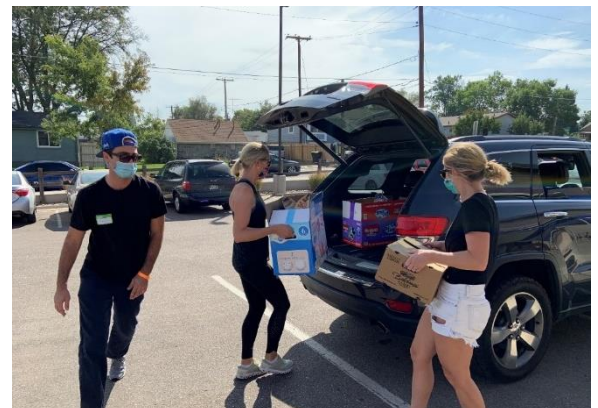
Volunteers loading food into cars during distribution.