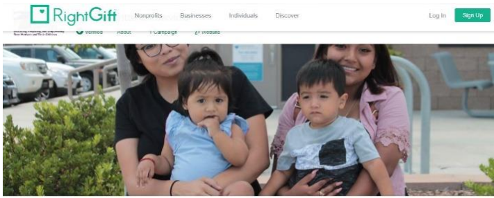
Florence Crittenton Services 2020 School Supply Drive

Florence Crittenton Services has been running a School Supply Drive for years, and, like all things, has evolved with the times. We have always run the drive to collect supplies to pack backpacks with everything FloCrit moms are going to