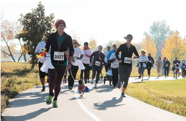
The race begins

Thanks to our supporters and community members, the 13 th Annual Miles for Moms 5K Run/Walk was a huge success! Over 300 participants ran and walked around Sloan's Lake to show their support of teen moms on a chilly, sunny Saturday morning. We raised over $60,000, which will continue to help teen mothers and their children at Florence Crittenton Services.