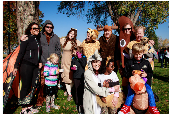
Teams dressed up for the race in creative costumes