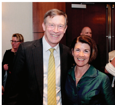
Governor Hickenlooper and Amy Dickinson