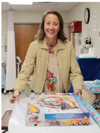
A volunteer wraps gifts