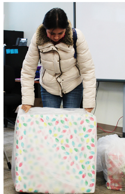
A teen mom picks up her gifts