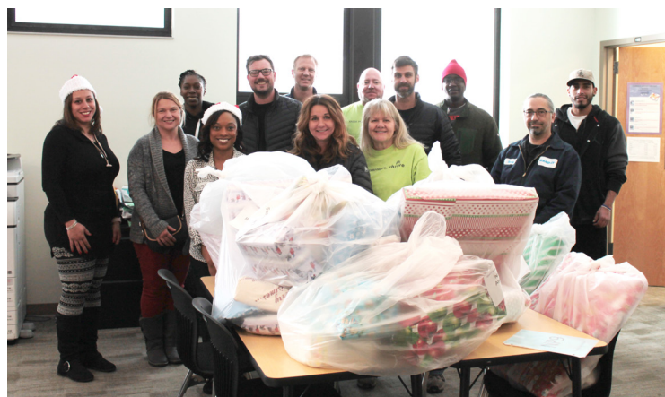
Volunteers help distribute gifts