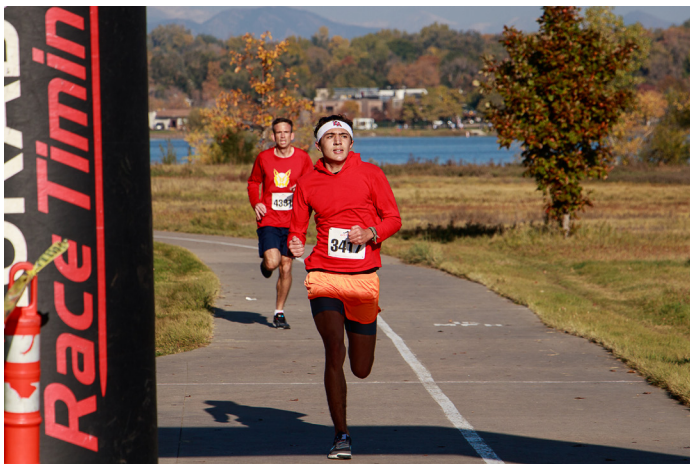
Runners cross the finish line