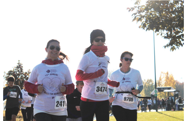
Runners make their way around Sloan's Lake