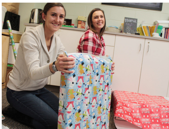
Volunteers wrap gifts